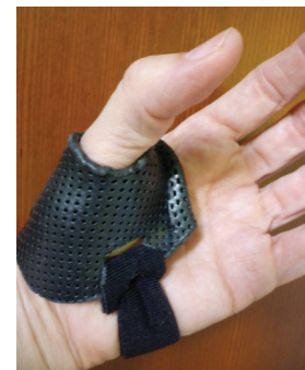
Orthosis for basal joint arthritis

Initially, a hand therapist can provide patient education including use of adaptive equipment, activity modification and special exercises to help reduce pain. A hand therapist can also provide a custom-fabricated brace or orthosis that will allow the thumb joint to rest and will provide support while performing daily activities. Hand therapy following surgery improves range of motion, and teaches the patient how to regain the function of the hand.